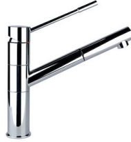
Mixer Tap Lorenzo 8466 000